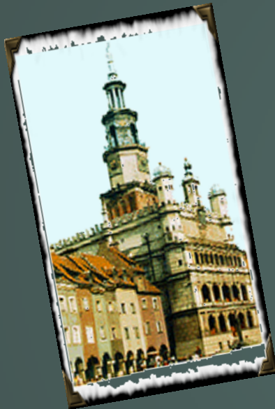
City Hall in Poznań